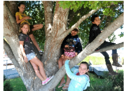
At right: Sixth grade girls in their favorite break and lunch spot.